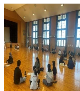
International Exchange Day at Hyogo Senior High School