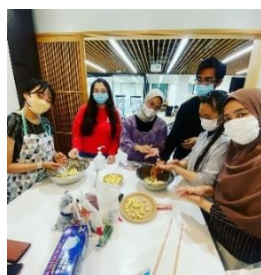
Vegan and Hala Food Day