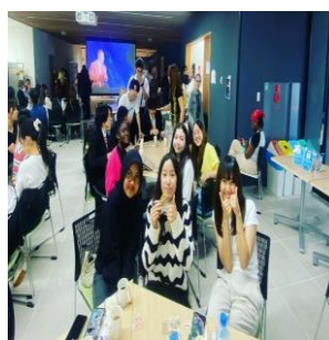
The Global House Summer Get-Together Event